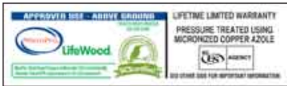
LifeWood end tag example

It’s easy to identify warranted LifeWood brand wood products. Simply look for the plastic end tag or ink stamp on each piece of LifeWood brand wood. Make sure you receive and retain all LifeWood end tags, as well as the original purchase receipt(s) from your lumber dealer or contractor/builder. In the event of a claim, it will be necessary to present this documentation for all materials claimed.